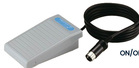
ON/OFF foot pedal